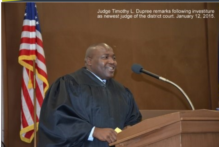
Judge Timothy L. Dupree remarks following investiture as newest judge of the district court. January 12, 2015.