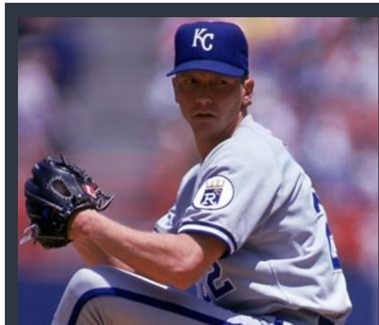
Jeff Montgomery spent 12 of his 13 seasons in the Major Leagues pitching for the Kansas City Royals.

And, last but not least, former Kansas City Royal Jeff Montgomery will be our featured speaker. Montgomery was selected for the Major League Baseball All-Star Game three times, has been inducted into the Royal's Hall of Fame and now serves as a commentator for Fox Sports Kansas City.